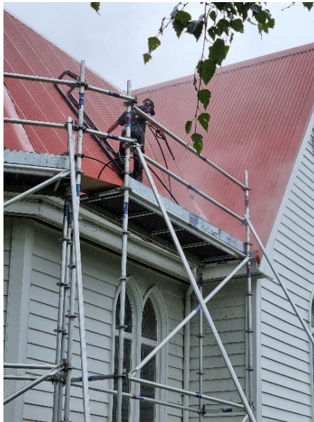
Cleaning the roof

In recent times, at over 30 years old the roof coating was showing the signs of age. The contract included a thorough clean of the roof, applying an undercoat, followed by two top coats. The decision by Vestry was to maintain the colour red, in keeping with the heritage status of the church.