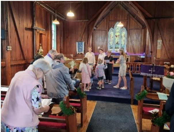
December Family Service St Peter's

The bells have been tolled at many a funeral or special remembrance, the last significant times being for the Remembrance Service for the Christchurch Mosque victims, one toll for very death, and more recently 96 times on the occasion of Queen Elizabeth's funeral. On a more cheerful note the bells have rung out in tuneful celebration as the bride walks down the aisle.