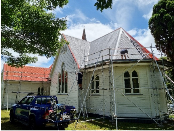
The undercoat is applied