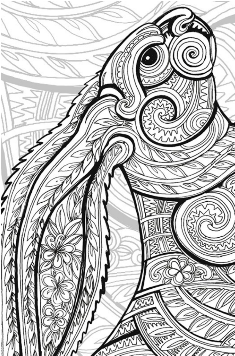
EASTER HARE Colouring Page