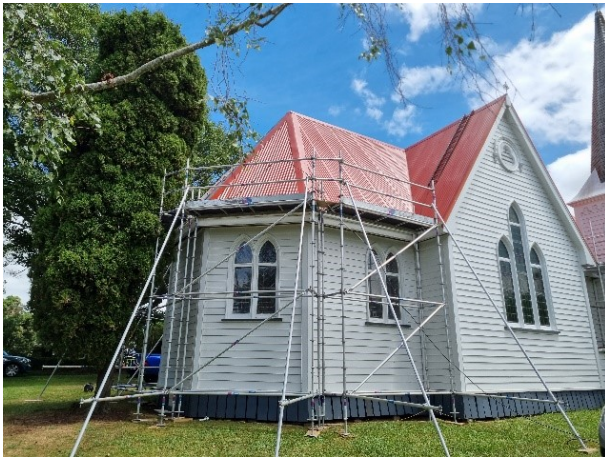
All done! A shiny new coat

The current roof has a story of its own to be told, as described in the history of the church of St Mary on the Hill, The Bells of St Mary's . In late 1990 Vestry was successful in persuading