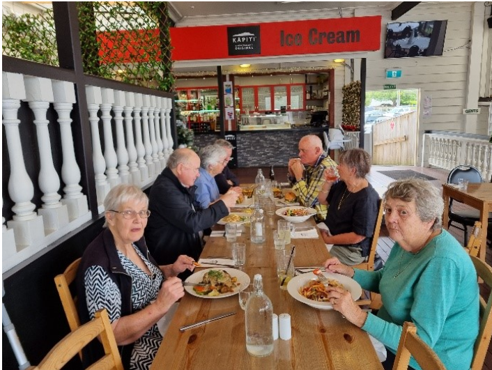
Lunch at the Kentish Hotel

Every time we start to plan a journey in the way we did before Covid, we hit problems. We did, however, manage to organise our end of year lunch which we held at the Kentish pub in Waiuku. Starting with morning coffee at Calendula Cottage, Glenbrook, we end up at the Kentish for lunch. This venue is always popular with our Wanderers and the menu is very good.